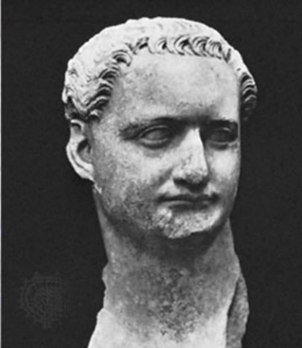
Domitian 81-96 AD