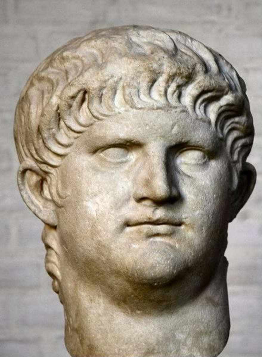
Nero 54-68 AD